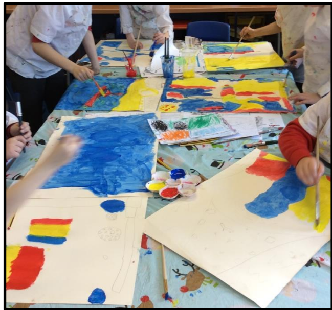
working with the artists in class 3