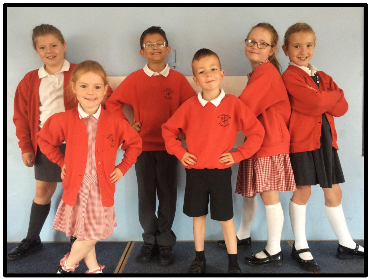
Grey trousers; skirts; shorts; pinafores. White polo shirt. Red & white checked dress/jumpsuit.